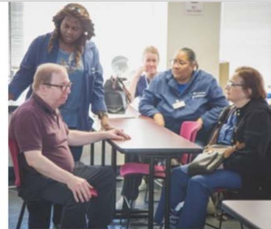
Home health aides from VNSNY's private pay division, Partners in Care, observe a role-playing exercise, as part of a training session on how to enhance the experience of their patients and clients.

The campaign has led to a steady uptick in the patient satisfaction scores of VNSNY's care teams, and a new appreciation for how