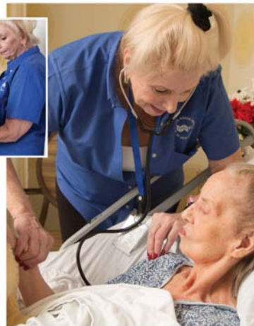
VNSNY is helping area nursing homes access hospice services. Above: A VNSNY Hospice nurse (in blue shirt) and facility nurse tend to a patient at the Hamilton Park Nursing and Rehabilitation Center in Brooklyn.