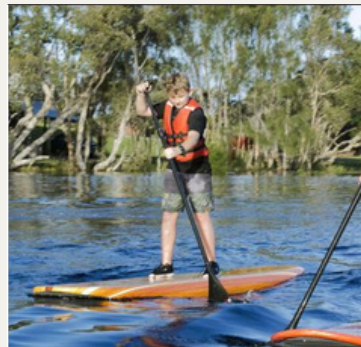
Watersports on Lake Ainsworth