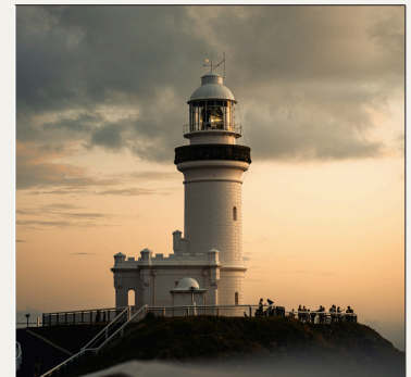
Visit Byron Bay