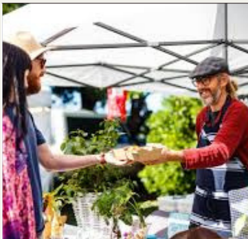
Ballina Farmers Market