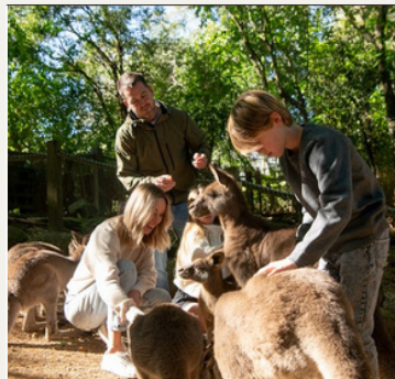
Byron Bay Wildlife Sanctuary