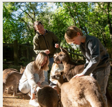
Byron Bay Wildlife Sanctuary