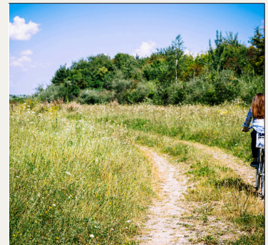
Cycling and bike rides