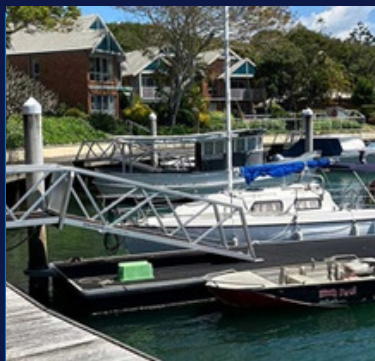
Banora Point traditionally belongs to the Bundjalung people. The Bundjalung Nation is one of the largest Aboriginal nations in Australia.