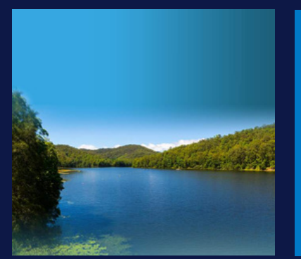
Banora Point is part of the larger Tweed Shire, which is renowned for its unique and diverse ecosystem. The area is home to a variety of plants and animals, plus the endangered Tweed Coast rainforest.