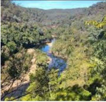
Mitchell Walking & Cycling Trail