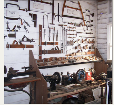
Bairnsdale History Museum