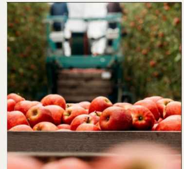
Bairnsdale Local Produce