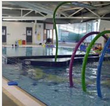
Bairnsdale Aquatic Centre