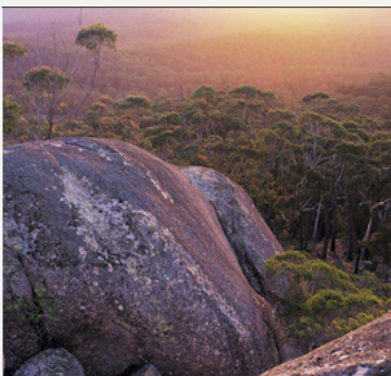
Croajingolong National Park