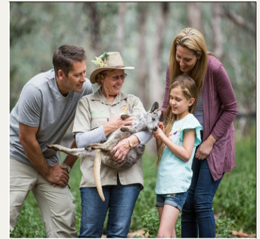
Tamworth Marsupial Park