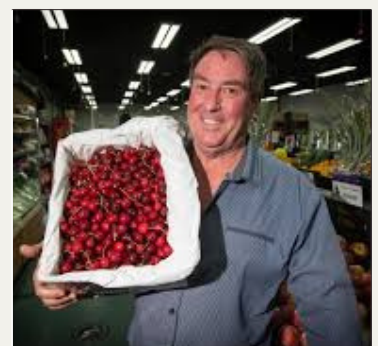
Tamworth Growers Market