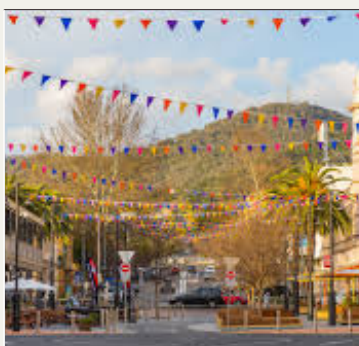
Explore Peel Street