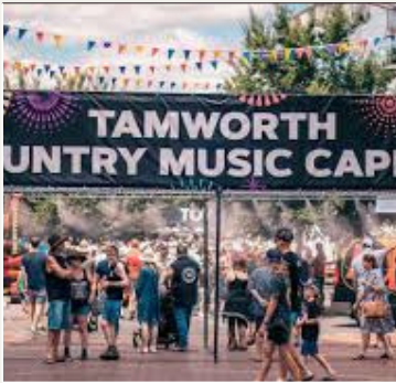
Tamworth Country Music Festival