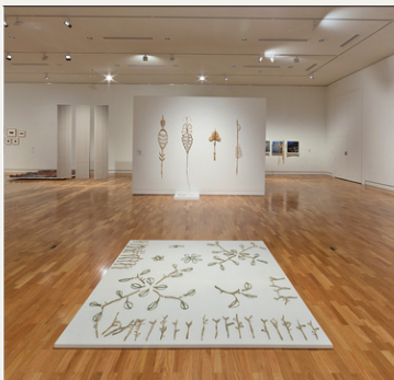
Tamworth Regional Art Gallery