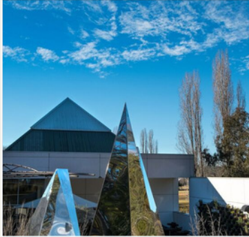
New England Regional Art Museum