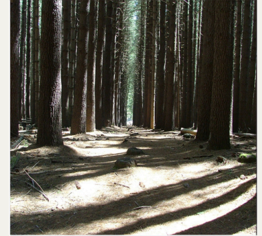
Armidale Pine Forest