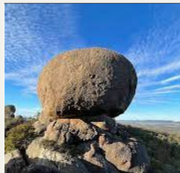
Cathedral Rock National Park