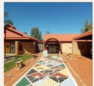
Aboriginal Cultural Centre