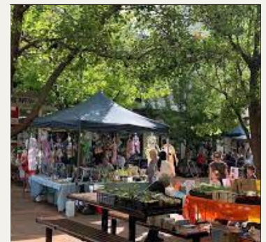
Armidale Farmers Market