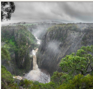
Oxley Wild Rivers National Park