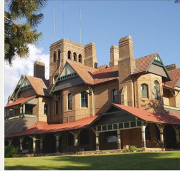
UNE Heritage Centre