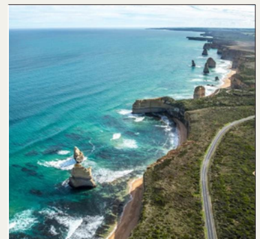
Great Ocean Road