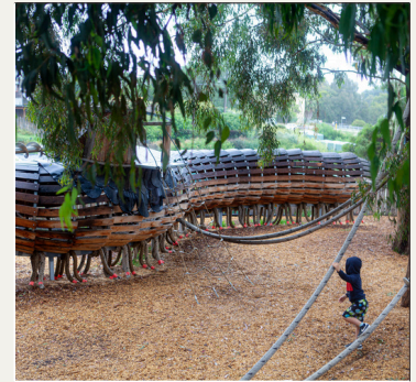
Ceres Community Environment Park