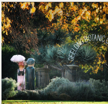
Geelong Botanical Garden