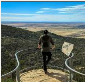
You Yangs National Park