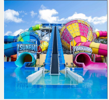
Adventure Park Geelong