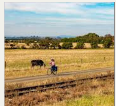
Bellarine Rail Trail