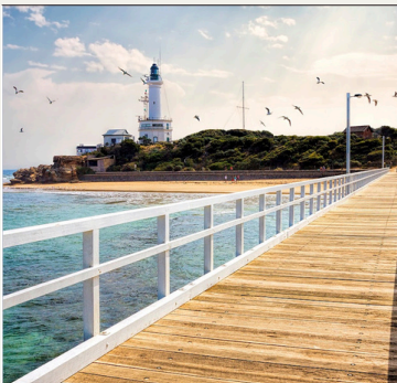
Bellarine Peninsula Coast