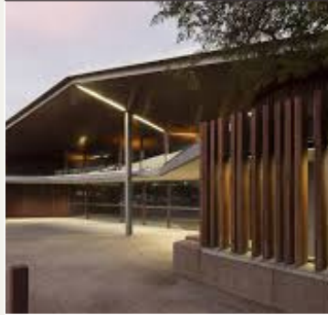
Port of Echuca Discovery Centre