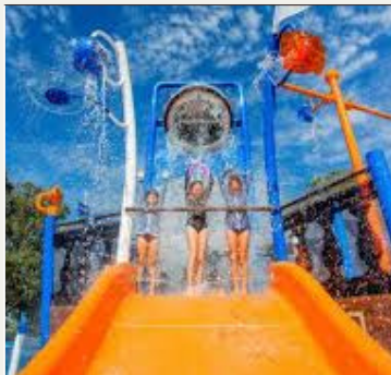
Echuca Adventure Park