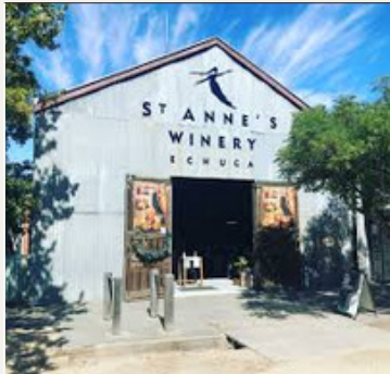
Local wineries & Breweries