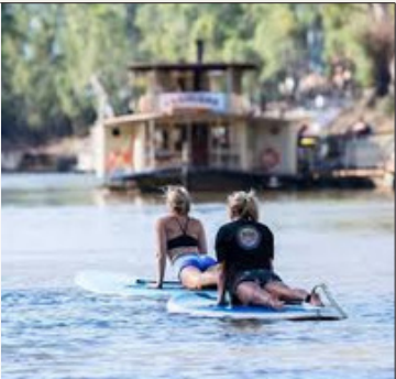
River water sports