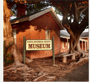
Echuca Historical Society Centre