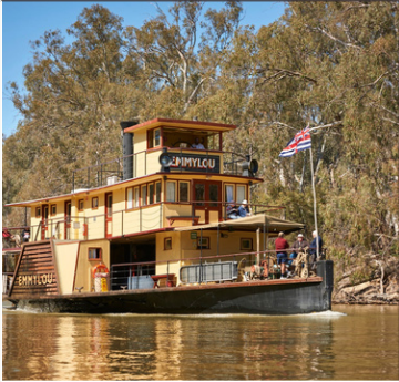
Murray River Padde Steamer