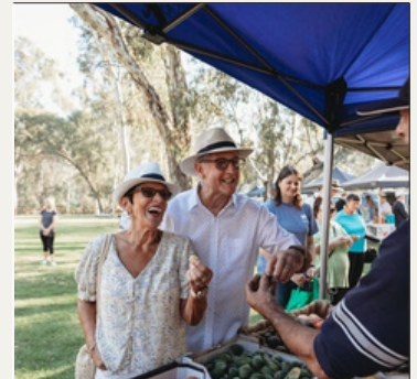
Echuca Farmers Market