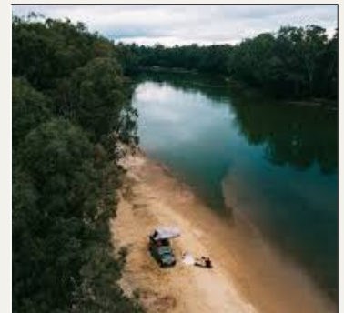
Barmah National Park