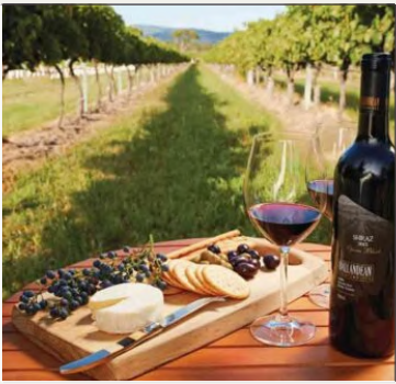
Wine Tasting in Granite Belt