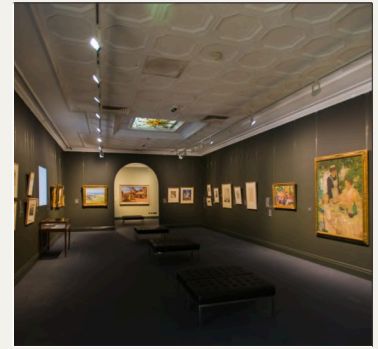
Toowoomba Regional Art Gallery