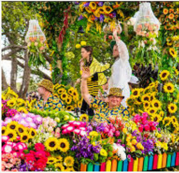
Carnival of Flowers