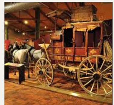
Cobb & Co Museum