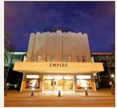
Toowoomba Empire Theatre