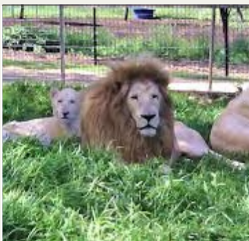
Darling Downs Zoo