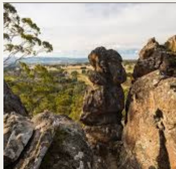
Visit Hanging Rock