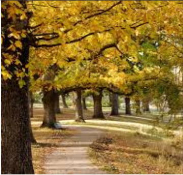
Kyneton Botanical Gardens