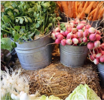
Kyneton Farmers Market