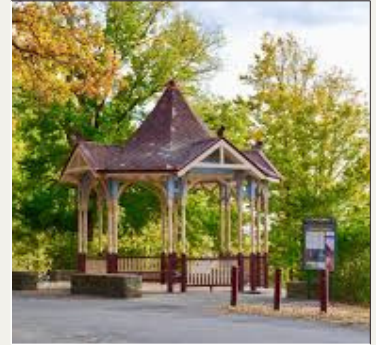
Kyneton Mineral Springs