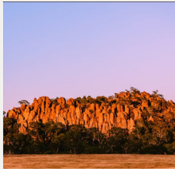
Macedon Ranges Park