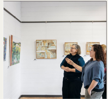
Kyneton Art Galleries