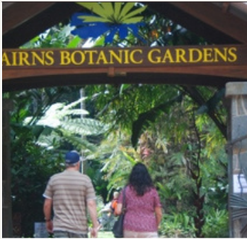
Cairns Botanical Garden