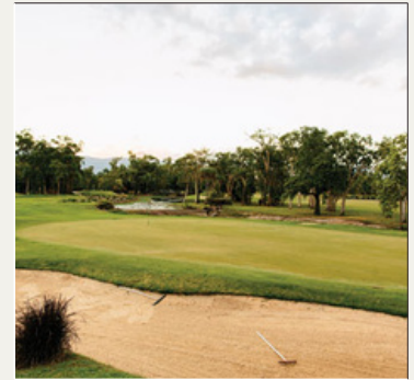
Cairns Golf Club