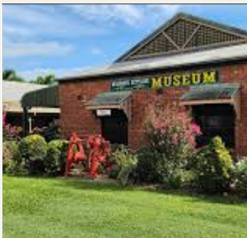
Mulgrave Settlers Museum