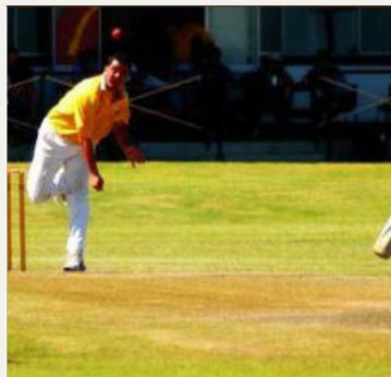
Goldfield Ashes Cricket Club