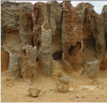
Cape Bridgewater Blowholes