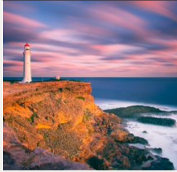
Cape Nelson Lighthouse