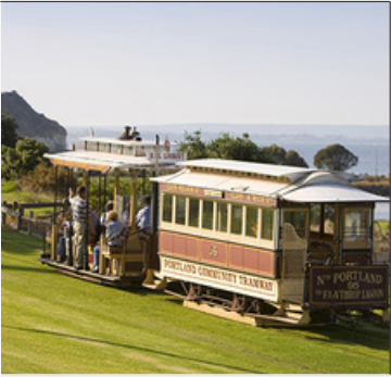
Portland Cable Trams