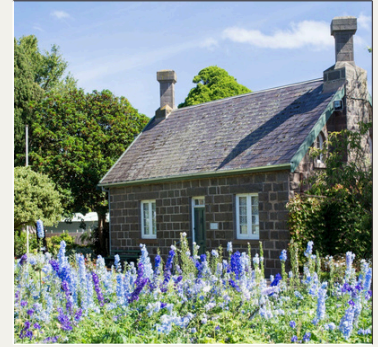
Portland Botanic Gardens