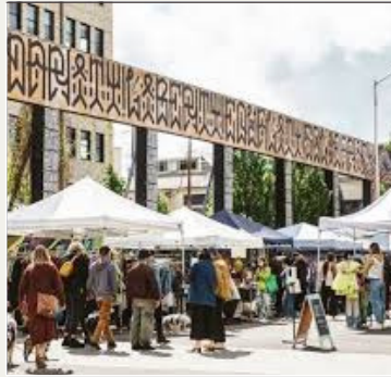
Portland Vintage Market