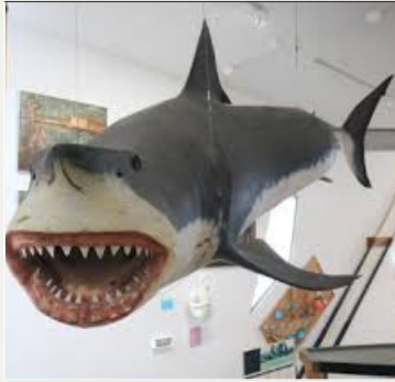
Maritime Discovery Centre