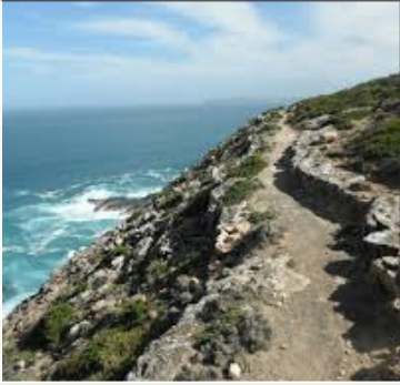
Great South West Walk