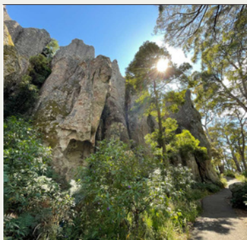
Visit Hanging Rock