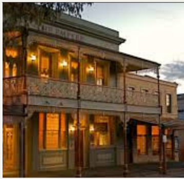
The Empyre Hotel