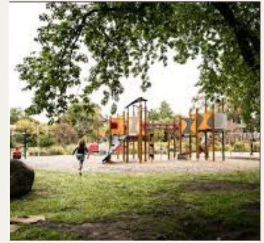
Woodend Children's Park