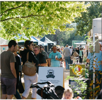
Woodend Farmers Market