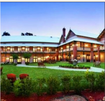
Macedon Ranges Spa