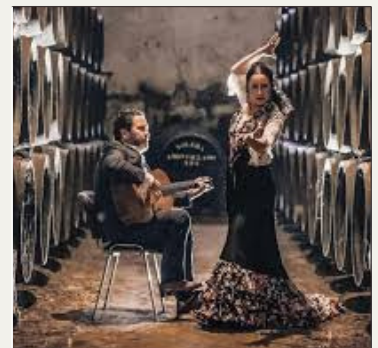
Woodend Winter Arts Festival