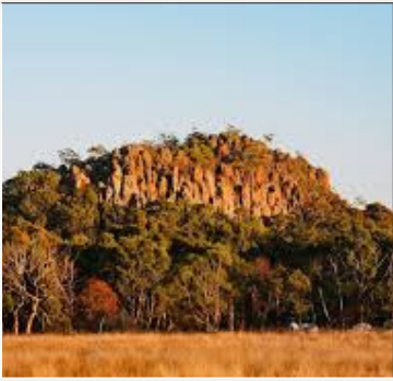
Macedon Ranges Park