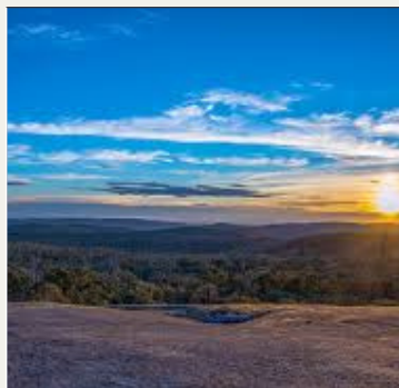
Chiltern Mt National Park