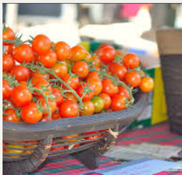
Albury Wodonga Farmers Market