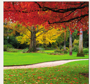
Albury Botanical Gardens