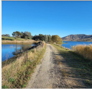
Wodonga Rail Trail