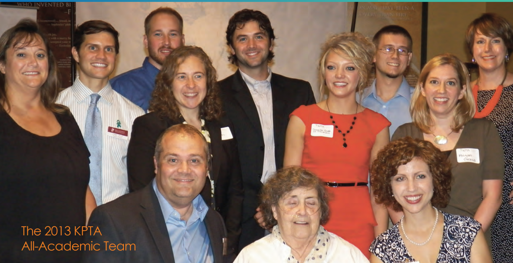
The 2013 KPTA All-Academic Team

The 2013 All-Academic Team at the Annual KPTA Fall Conference