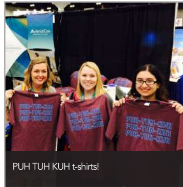
PUH TUH KUH t-shirts!