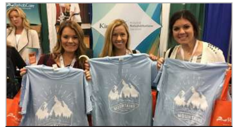
Students showing off their fun new Kindred RehabCare AOTA t-shirts!