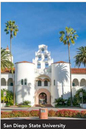
San Diego State University